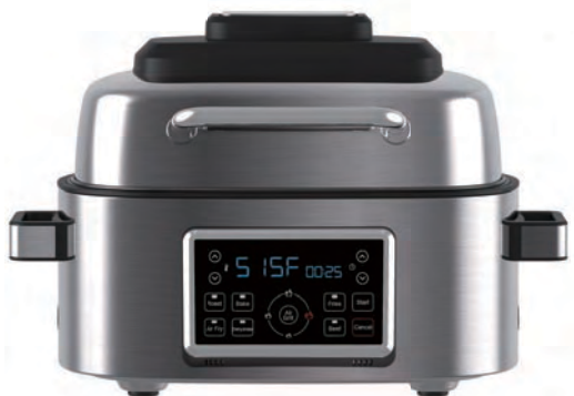
Air Grill Cooker