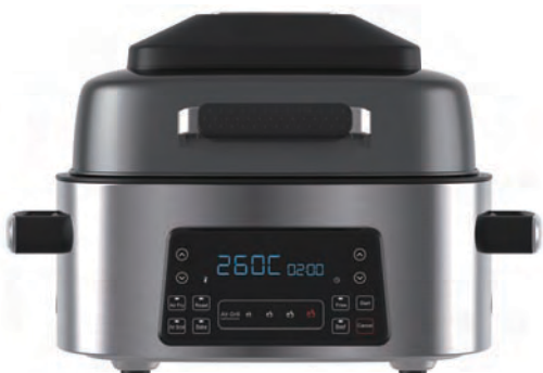
Air Grill Cooker