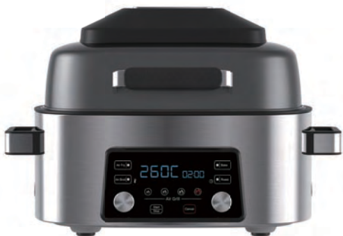
Air Grill Cooker