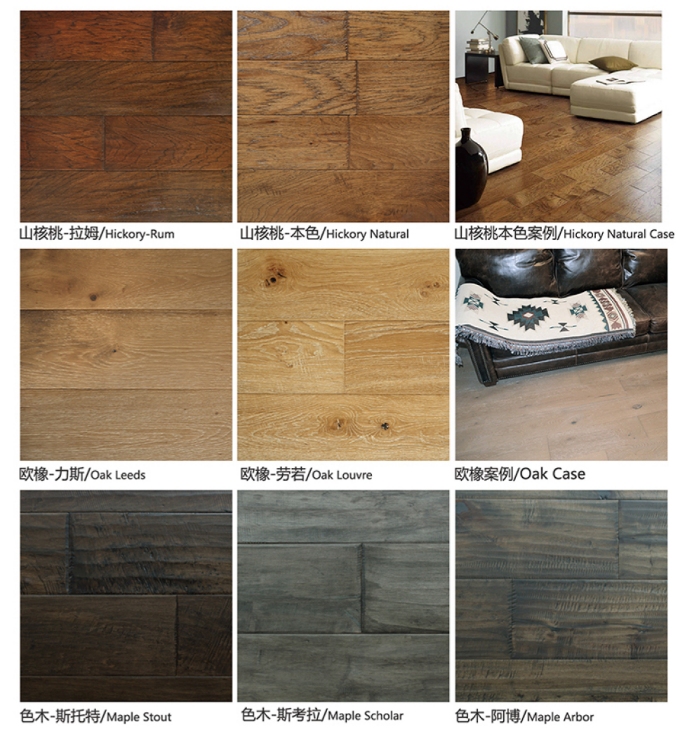
山核桃-拉姆/Hickory-Rum 山核桃-本色/Hickory Natural 山核桃本色案例/Hickory Natural Case 欧橡-力斯/Oak Leeds 欧橡-劳若/Oak Louve 欧橡案例/Oak Case 色木-斯托特/Maple Stout 色木-斯考拉/Maple Scholar 色木-阿博/Maple Arbor