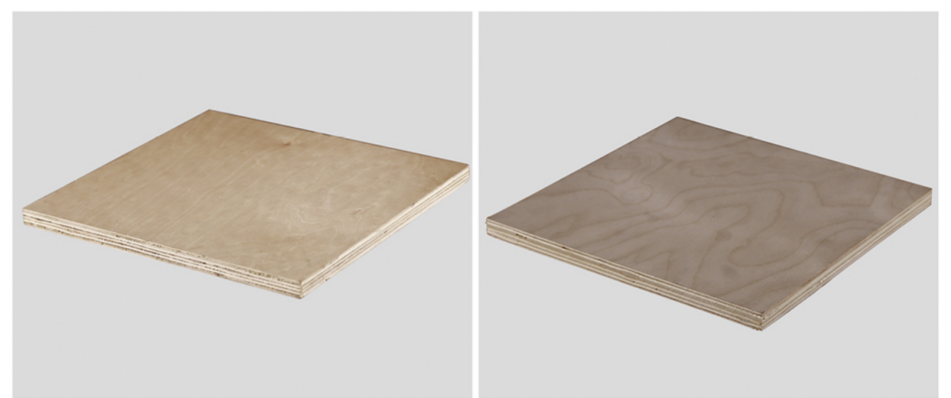
UV 油漆胶合板 /UV Painting Plywood 白桦面胶合板 /Birch Face Plywood 桦木面胶合板 /Birch Face Plywood 白桦面胶合板 /Birch Face Plywood UV 油漆胶合板 /UV Painting Plywood UV 油漆胶合板 /UV Painting Plywood